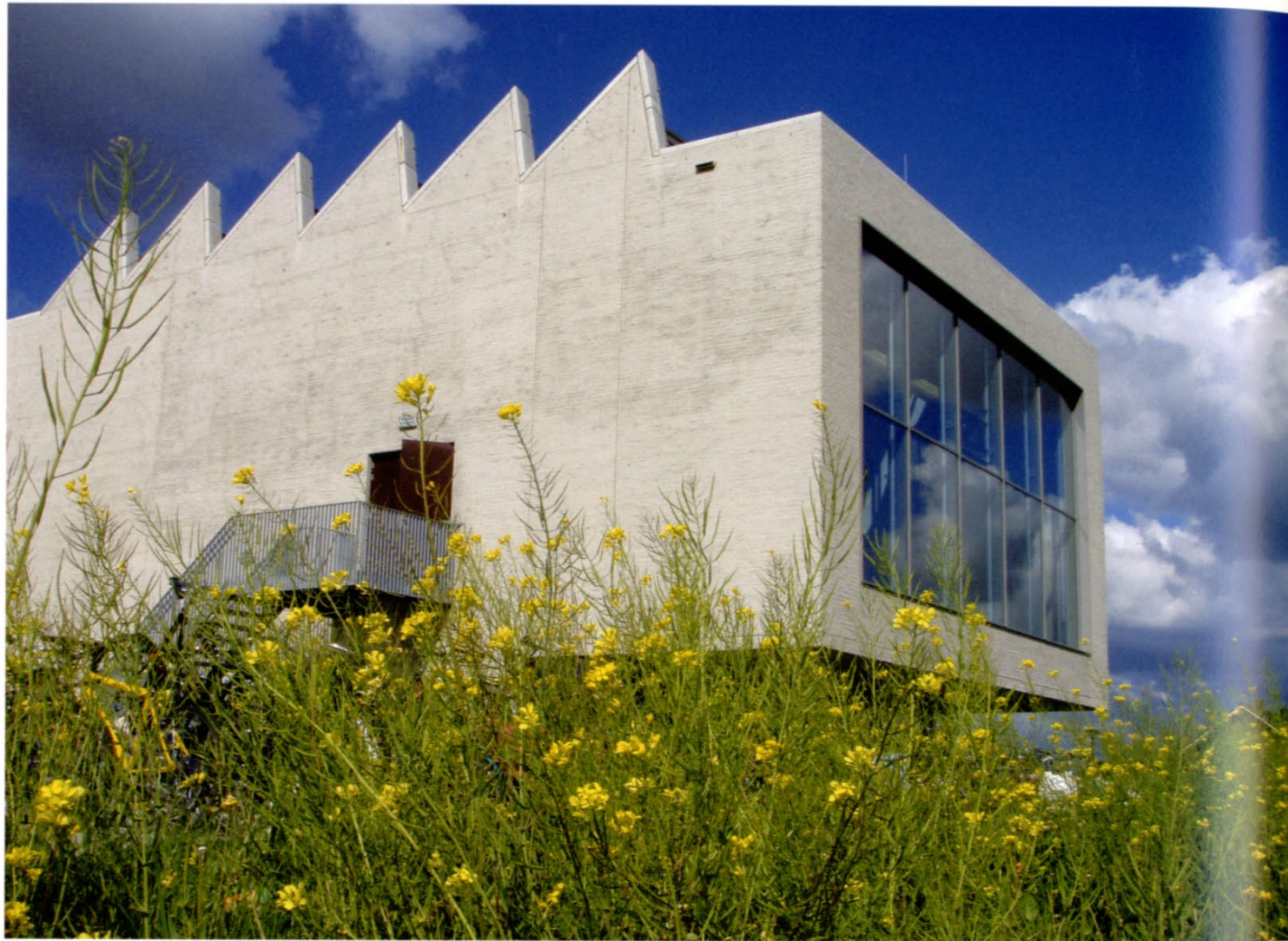
↑ | Exterior view → | Staircase

Address: Weegbree 2, Heerhugowaard, The Netherlands. Client: Municipality of Heerhugowaard. Other creatives involved: Dorte Kristensen and Lissette Plouvier. Completion: 2007. Size: 3,020 m 2 .